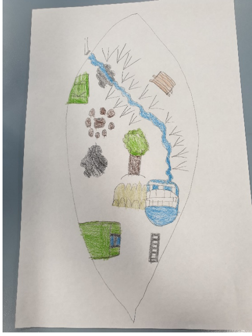
Student designs for NILE space