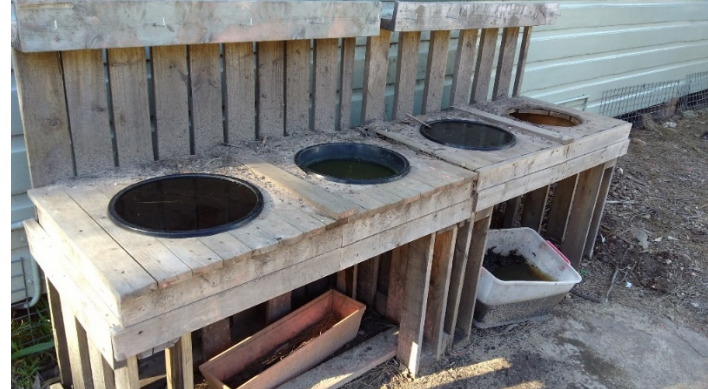
Mud Kitchen, made from repurposed pallets.....

Engadine Public School. Bunnings helped out twice this year. Indigenous garden going to be built from funds raised from recent school fete. Sydney Wildflower garden course Indigenous workshop in couple of weeks. Small schools should be encouraged to apply for grants. Such as Tradies Community Grant. Mining under Woronora dam Sutherland Shire Environment Centre SSEC petition